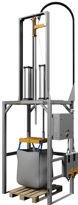
OptiFeed BigBag FPS16-E

An electropneumatic controller uses a sensor to monitor the powder flow and control the fresh powder supply.