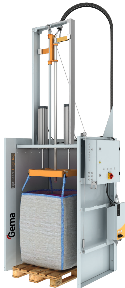
OptiFeed BigBag FPS16

Your global partner for high quality powder coating